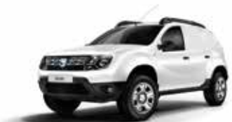
Glacier White (369)