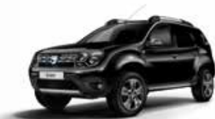
Pearl Black (676)