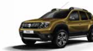
Pennine Green (DPC)